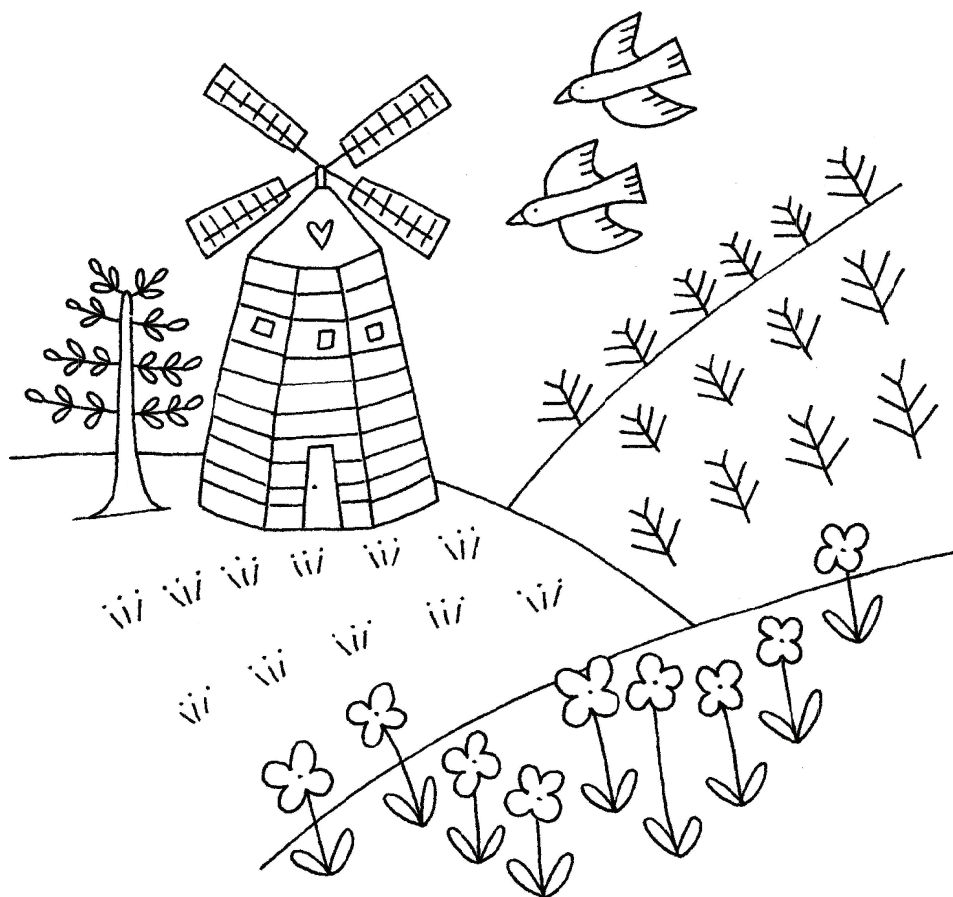
“OWL & HARE HOLLOW” The Old Windmill

Print your chosen design/templates from the Homespun website. Before printing, check the Print dialog box – it is important that in the field next to the words “Page Scaling” you have selected “None” to ensure your design/templates print out at 100%.