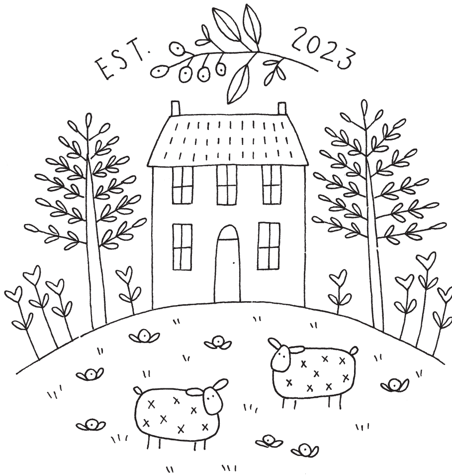
“OWL & HARE HOLLOW” The Homestead stitchery design

Print your chosen design/templates from the Homespun website. Before printing, check the Print dialog box – it is important that in the field next to the words “Page Scaling” you have selected “None” to ensure your design/templates print out at 100%.