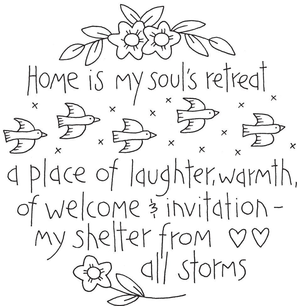
“OWL & HARE HOLLOW” My Soul's Retreat stitchery design

Print your chosen design/templates from the Homespun website. Before printing, check the Print dialog box – it is important that in the field next to the words “Page Scaling” you have selected “None” to ensure your design/templates print out at 100%.