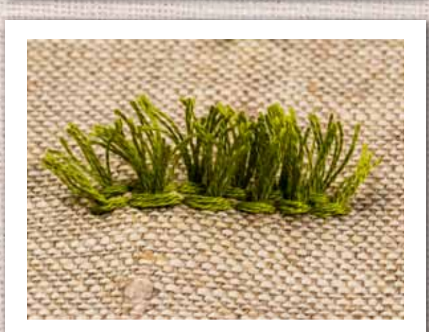
22 Continuous Turkey stitch with the loops trimmed and fluffed. This can be used for flower centres, gum blossoms, grassy fields, manes and so on.