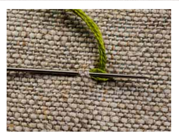
14 For the loop part, keep thread above the needle, make another backstitch and come up at the end of the previous stitch, halfway along the loop stitch.