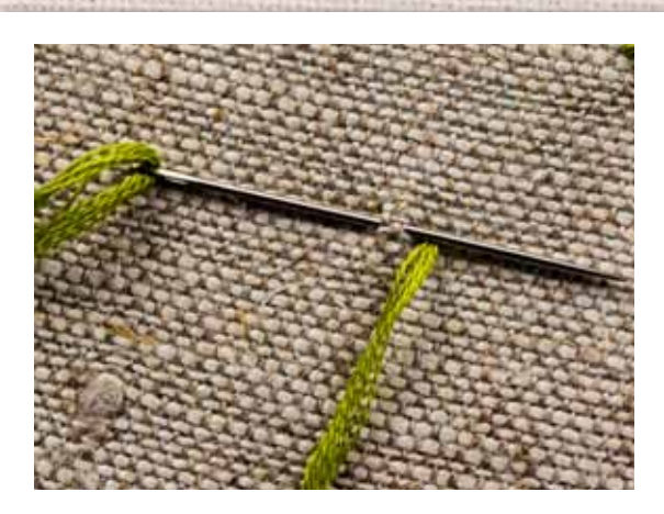
12 Turkey stitch can also be worked continuously to create a line of loops or trimmed tails. This time, start with a knot at the back, come up and make a backstitch.