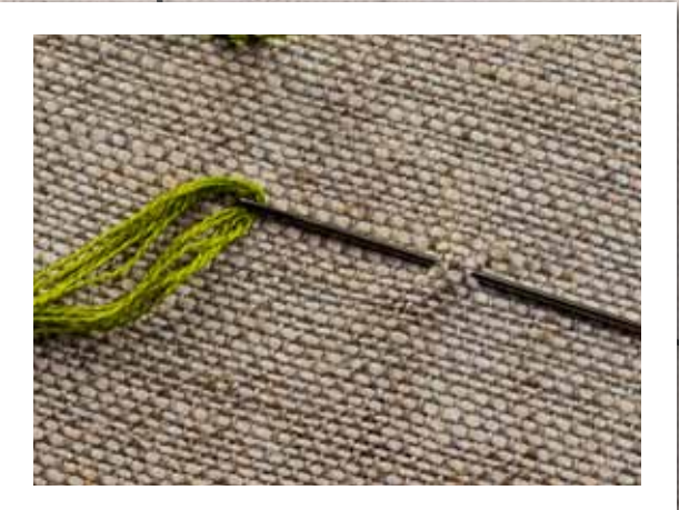
7A related type of isolated stitch is the tufted knot, which is often used in tied quilting. It begins exactly the same way as an individual Turkey stitch.