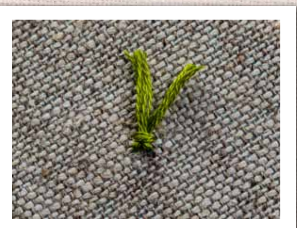
10 When the loop is tightened and the tail is trimmed, you can see that this stitch lies down on the fabric more than the single Turkey knot. Bunny ears perhaps?