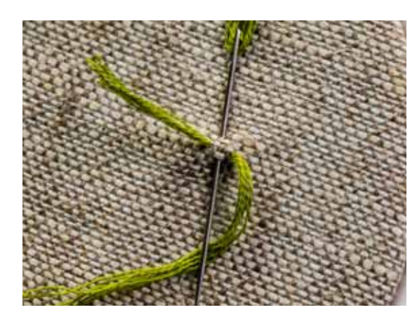
Of this time, make the second half of the stitch at 90 degrees to the first. The needle crosses over the previous stitch on the back. Keep the thread loop under the needle.