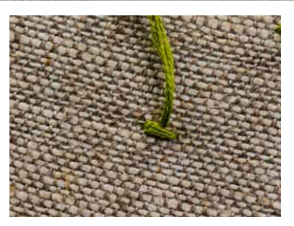
13Bring the needle out halfway along the stitch, not at the entry point. Keep the thread below the needle for this part of the stitch so the tail emerges above it.