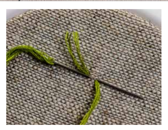
3 Insert the needle again as close to the starting hole as possible and bring it out at the same place as before. Pull the thread through without dislodging the first stitch.