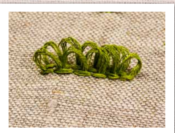
21 \\ {\hbox{Two rows of continuous looped Turkey stitch.}} \\ {\hbox{Staggering the stitches means the loops alternate.}} \\ {\hbox{This stitch could be used for short curly hair on a doll.}} \\