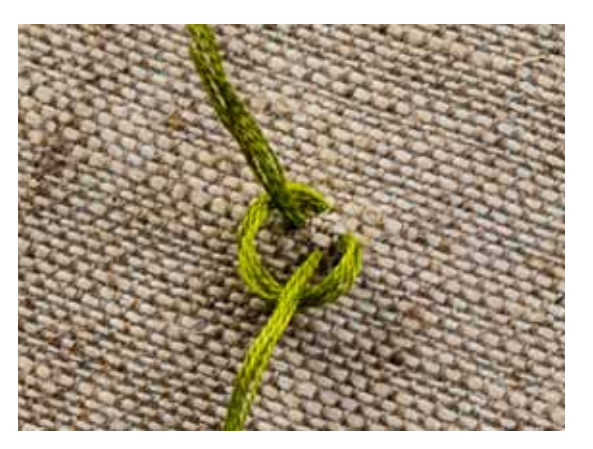
As you pull the thread through, make sure that both tails are caught within the loop as shown. Here the thread is not yet pulled right through to show the loop and tails clearly.