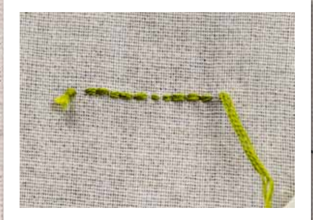
19 \\ \text{The back of the work after doing one line of loops} \\ \\ \text{looks like a single line of backstitch.}