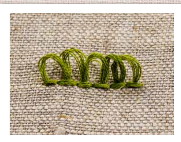
18 Continue to make backstitches and loop stitches alternately along the line for the desired length. You could work in a circle around a flower centre instead of a line.