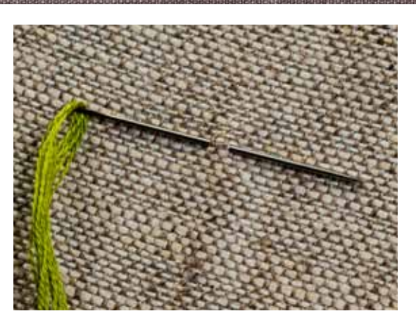
1 If you're aiming for a fluffy look to this stitch, use six strands of thread, separated and threaded together in the needle. Insert the needle from the front and come up nearby.