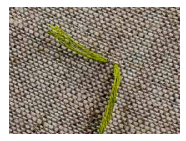
2 Pull the needle through, leaving a tail of thread at the start. It should be at least 10mm (%in) long – it can be trimmed to a shorter length later if needed.