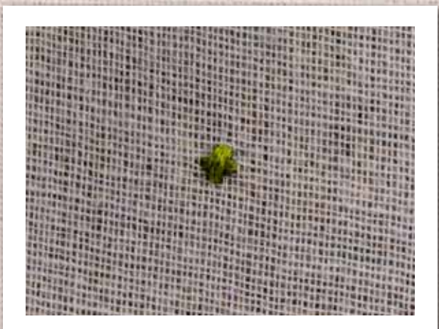
11 At the back of the tufted knot, you can see that a small cross stitch is formed. Tufted knots can be spaced over a puffy quilt to maintain the loft of the batting.