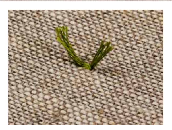
4 If you're doing a single Turkey stitch, for flower stamens for example, trim the thread tail to match the starting tail or both of them to the desired length.