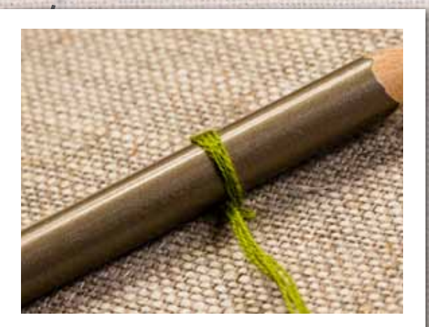
15 Depending on how big you want the loops or tails to be, use a round object like a pencil to set the loop size and pull the thread so it sits around the object.