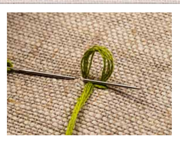
16^{\rm Slide} out the pencil but don't pull the thread. Make another backstitch with the thread below the needle. It should end half a stitch width past the base of the loop.