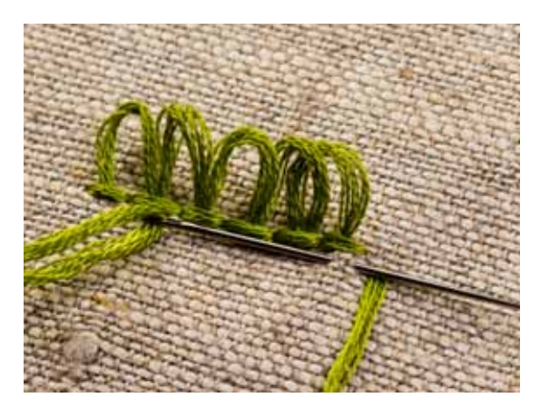
20 To fill an area, work subsequent rows of continuous Turkey stitch one under the other. Stagger the stitches of alternate rows so the loops overlap.