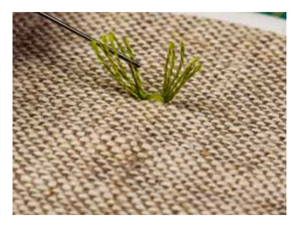
5 Separate and fluff the strands with the eye end of the needle to enhance the hairy effect of the stitch. If you use indivisible threads such as Perlé, omit this step.