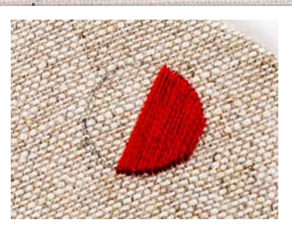
3 Continue placing stitches side by side until one half of the shape is filled. The stitch direction should suit the motif: echoing the lie of fur or leaf veins for example.