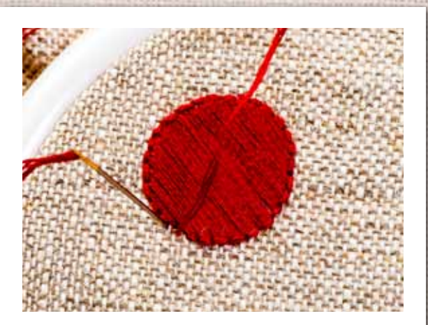
6 You can further enhance the shape with an outline of backstitch if you wish.