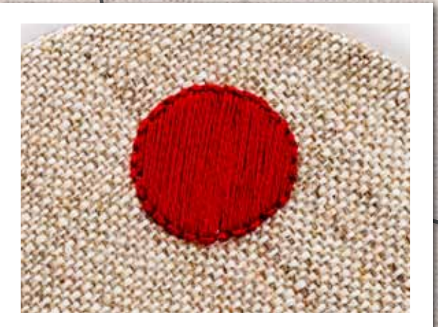
These outlines give a different effect to the stitch, but can also be used to conceal slight flaws in the stitching to give a smooth edge to the shape.