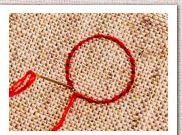
10^{\rm A} third variation also results in a more defined finished stitch. To begin, work a line of backstitch just inside the edge of the shape.