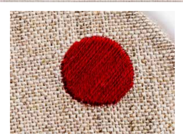
The completed circle filled in simple satin stitch. This example is worked in three strands of embroidery floss.