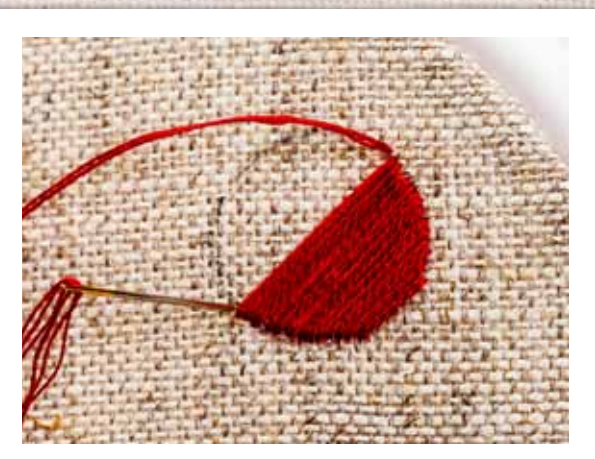
4 When one side of the shape is filled, return to the centre and stitch outwards to the other side in the same way.