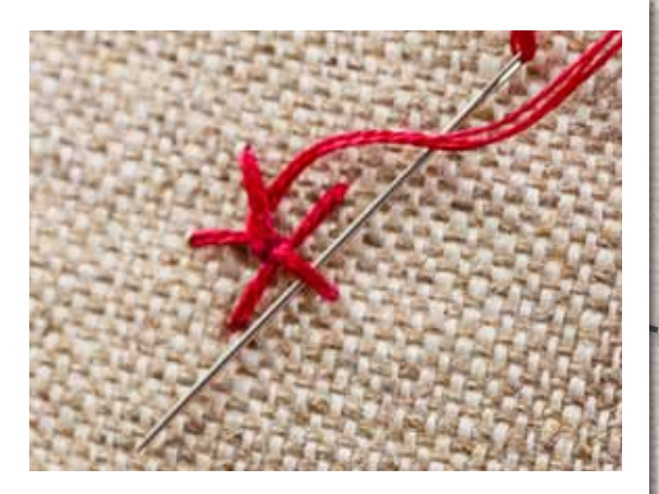
7Pull the needle and thread through, then go over the next spoke and under the following one.