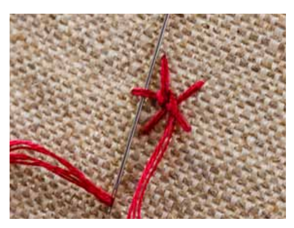
Continue weaving the needle over and under the spokes in turn, rotating the work as needed.