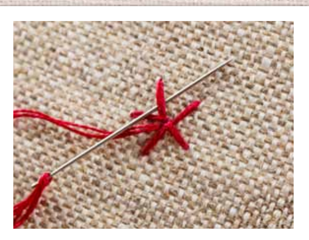
6^{\mathrm{Bring}} the needle up near the centre between two spokes. Working clockwise, go over the nearest spoke and under the next one.