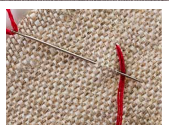
1 You must have an odd number of foundation spokes for this stitch. To begin, make a fly stitch that looks like a Y with the legs the length of the radius of the desired circle.