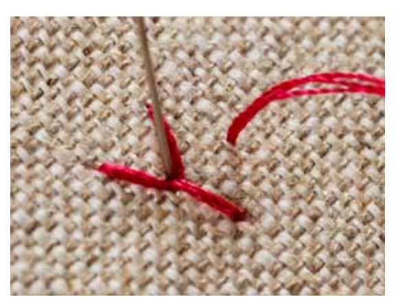
\mathbf{3} Bring the needle up halfway down one side and the same distance out from the centre and insert it at the junction of the Y.