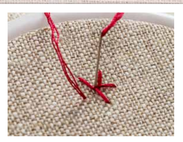
Repeat Step 3 on the other side. For circles larger than 12mm (½in) diameter, make the Y narrower at the top and put two spokes on each side to make a total of seven.