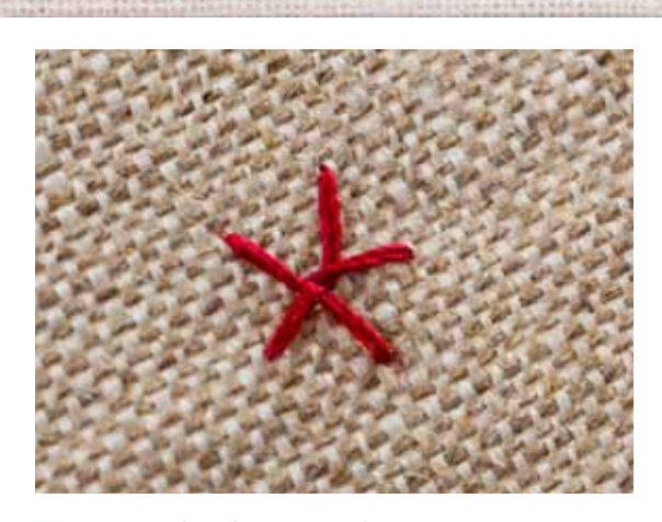
The ends of the five or seven foundation spokes should be reasonably evenly spaced and form a circle.