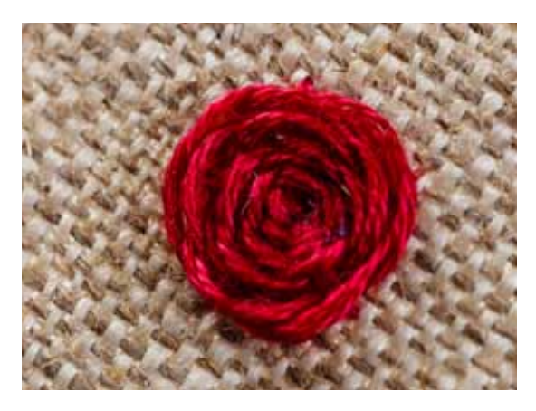
{f 1} When the spokes are full, take the needle to the back and finish off behind the completed woven spider's web rose.