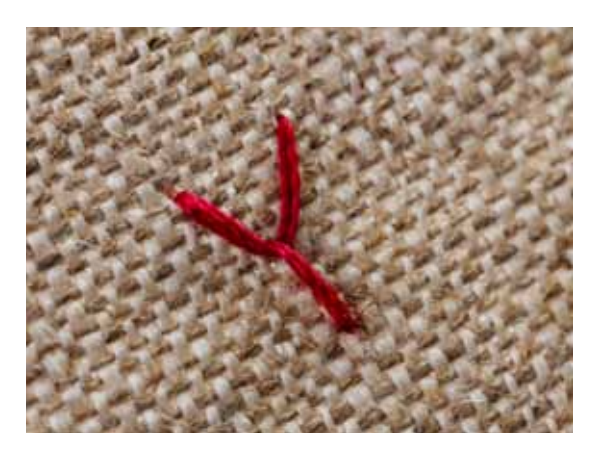
\mathbf{2}^{\text{Sew}} the holding stitch of the fly stitch same length as the previous two legs.