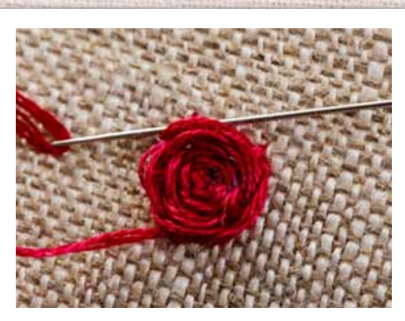
10^{\text{The stitches}} around the outer ends of the spokes are quite long and need to be fairly loose to maintain the rounded shape.